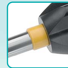
large yellow color code