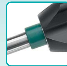
medium-large green color code