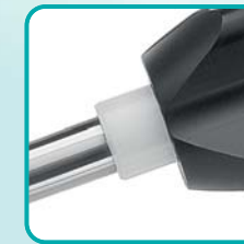
medium white color code