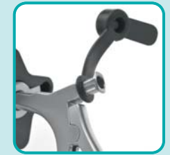
300-400-901 Silicon cap for closing luer-lock channel