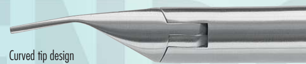
Curved tip design