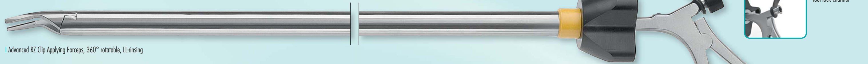
Advanced RZ Clip Applying Forceps, 360° rotatable, LL-rinsing