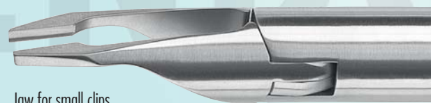
Jaw for small clips