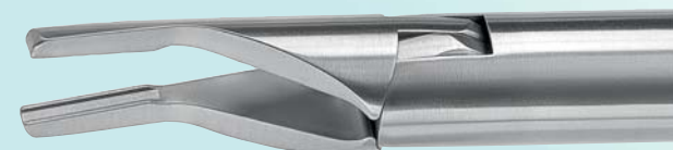
Jaw for medium and large clips