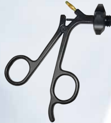
300-450-200 Plastic handle (multiple use)