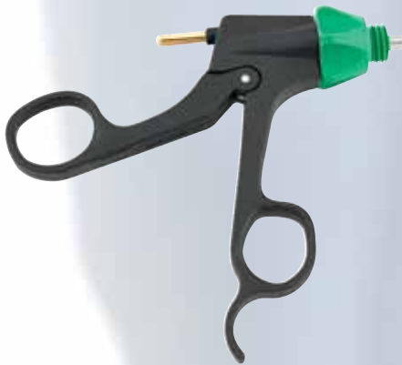
300-450-100 Plastic handle (multiple use)