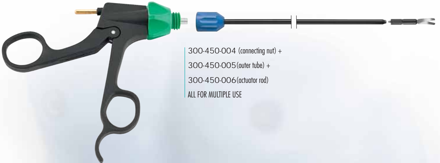
300-450-004 (connecting nut) + 300-450-005 (outer tube) + 300-450-006 (actuator rod) ALL FOR MULTIPLE USE